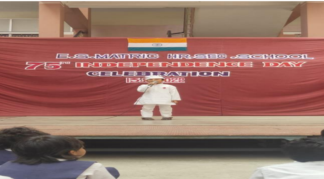
INDEPENDENCE DAY CELEBRATION @ Collectorate